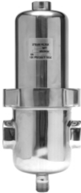
STEAM SCRUBBER FILTER