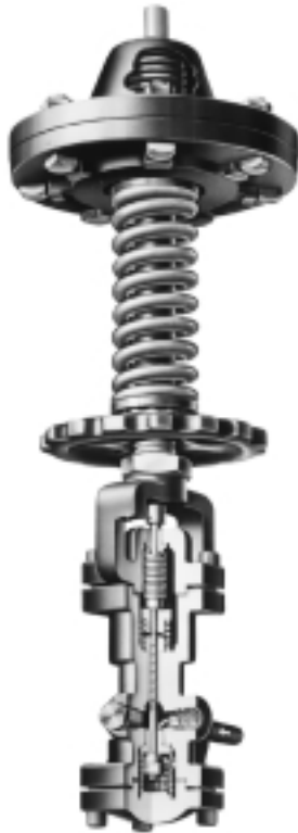
TYPE F46 PILOT