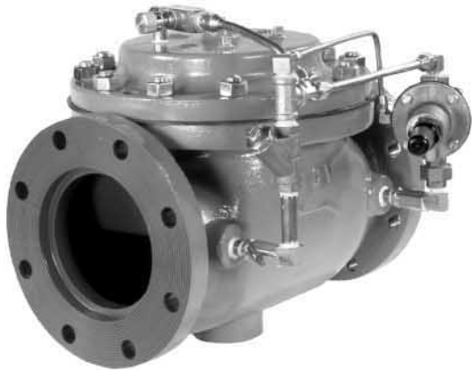
▲ Model 108-2

The Model 108-2 has a wide range of applications: anywhere a system must be protected from pressures that are too high (relief) or too low (sustaining).