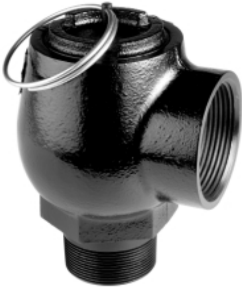
FIGURE 10 SERIES SAFETY VALVE