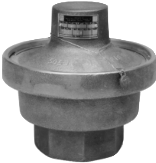
FIGURE 50 SERIES SAFETY VALVE