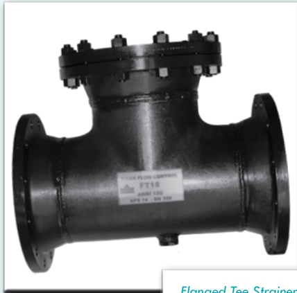
Flanged Tee Strainer with Bolted Cover