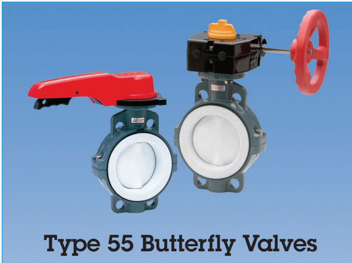
Type 55 Butterfly Valves